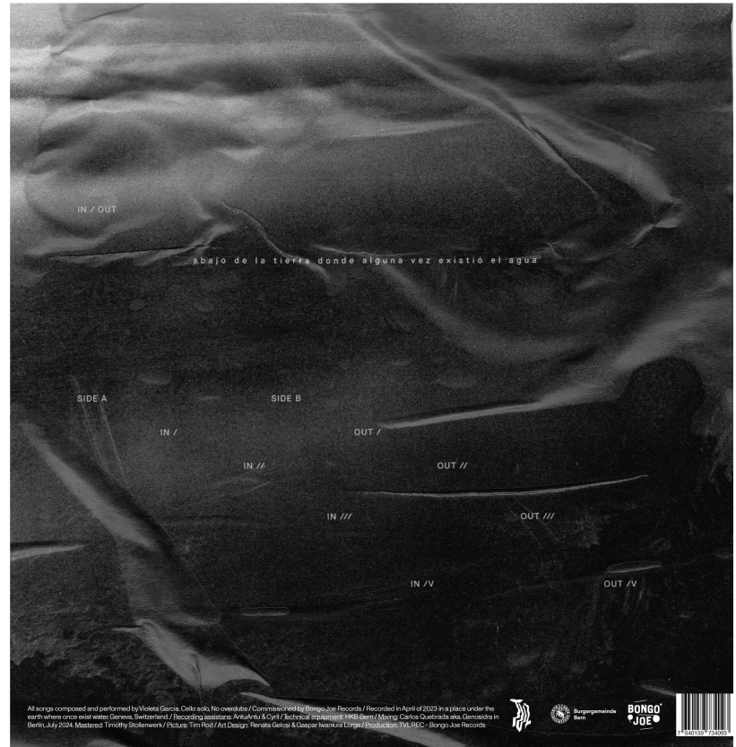
art vinyl cover: Renata Gelosi & Gaspar Iwaniura